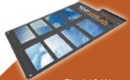
Flexi 12 Watt

Incorporating solid state, thin-film, Flexi solar cells, the Flexi 12 Watt provides an excellent choice for excursions that require lightweight, flexible and durable portable power.